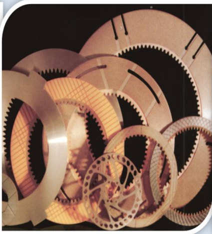
Earthmoving & Mining